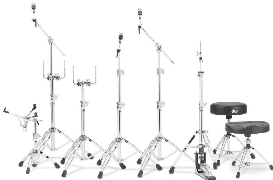
9300 snare drum